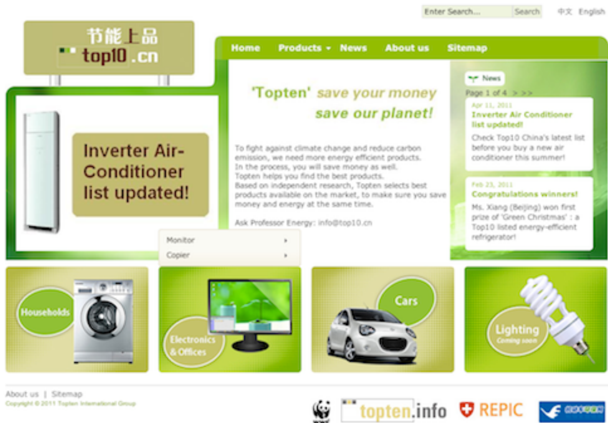
Figure: Screen shot entry page of Topten China

On 26 October 2010, www.top10.cn was publicly launched in Chinese (simplified Mandarin) and English with 7 product categories listing 259 products: refrigerators, washing machines, electrical water heaters, air conditioners (fixed speed and inverter), monitors, copiers and passenger cars. The expansion in 2011 will include several additional key product categories (e.g. TVs, lamps, microwave ovens).