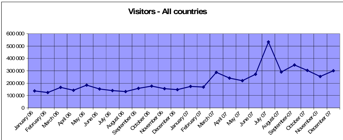
Pic.1. The growth tendency for all countries