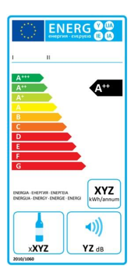
Wine storage appliances