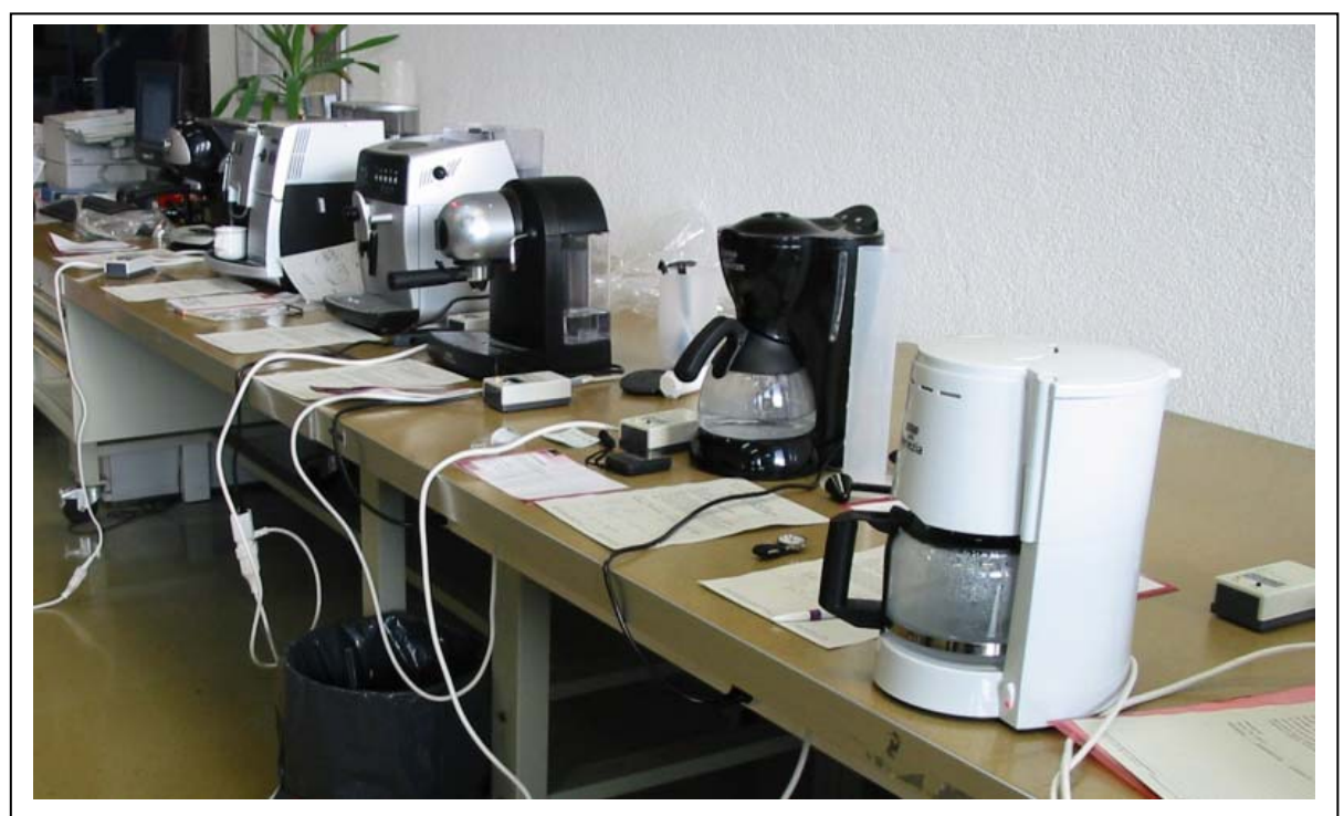
Fig. 1 Measuring campaign S.A.F.E. 2003