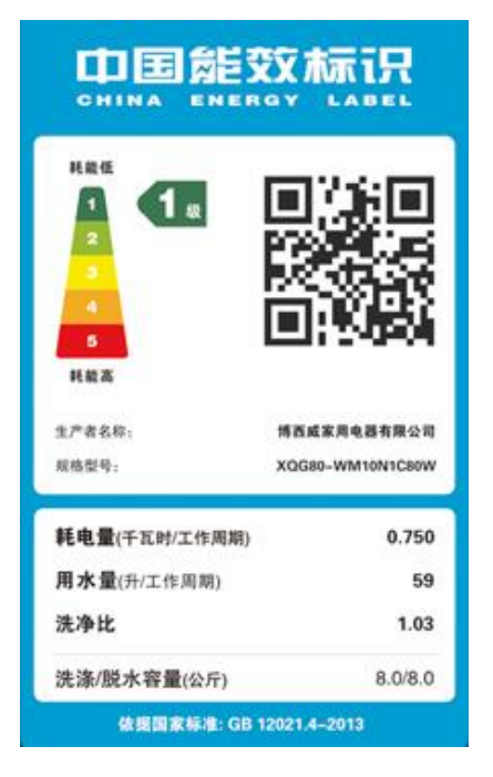
Figure 3: China Energy Label of a washing machine showing a QR code

The third version of the sticker, applied in 2014, added a QR code. With this improvement, consumers can scan the QR code and be directed to the Top10 website to check more details of the products they're interested in purchasing. They've also made the money savings more visible on the sticker, as this was the information they'd identified as most important to consumers.