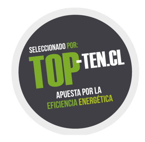
Figures 5 & 6. Top-Ten's logo on price comparator Solotodo's web (left) and Top-Ten virtual sticker design reading "selected by Top-Ten.cl, go for the energy efficiency" (right)

Broadcasting platforms: There are currently 2 content sections: "Noticias" (News) and "En La Prensa" (In the press) where Top-Ten Chile publishes weekly articles related to energy efficiency and contents that talk about what is happening in Chile and around the world at that stage. These articles are shared on our social networks (Facebook and Twitter) with the objective of generating continuity between the development of contents and Top-Ten's users and followers. These publications helped achieve more thant 4'700 followers in Facebook and 641 in Twitter.