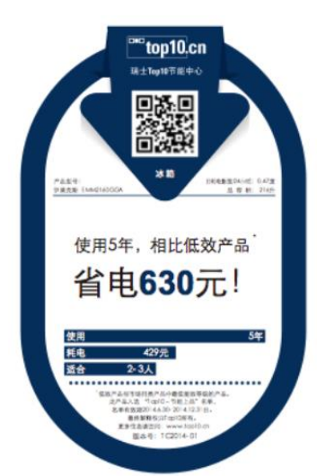
Figure 2: 3<sup>rd</sup> version of Topt10 energy saving sticker (2014)

At the same time, training programs were designed and in-store salesmen were trained to better explain the sticker and answer consumers' questions. A small-scale face-to-face survey was carried out with 40 Gome salesmen, who have first-hand experience dealing with consumers in-store. They gave a lot of practical suggestions, such as: in the sticker, a product's total energy consumption within 5 years was calculated but, for consumers, annual energy consumption might make more sense; for some products, this was changed in the second version of the sticker. 32 salesmen thought this sticker is helpful to both sell products and help consumers (see Figure 2).