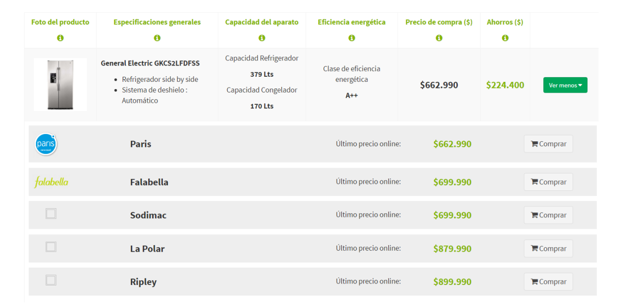
Figure 4. Top-ten Chile's "where to buy" option for a refrigerator, showing the different online stores where it's being sold and the different prices.

Top-Ten Chile's partner on this is Solotodo, a company that makes a database of Chile's most important online stores, the products they're selling and their prices. This database is updated every day, and due to the automatization between Top-Ten and Solotodo's work, the prices and market availability shown in Top-ten's web are also updated every 24 hours, keeping the information on the web real and dynamic and very easy to obtain.