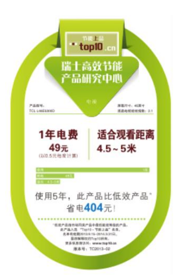
Figure 1. First version of Topten Energy Saver sticker (2013)

The total energy consumption of China accounts for 22% of the world's whole consumption. In 2014, household energy consumption in China was 693 TWh, an increase of 2.2% compared to 2013 [3]. Since 2004, China has a mandatory 'China Energy Label' which covers 34 products categories, most of which are household appliances, such as: air conditioners, televisions, washing machines, refrigerators, water heaters, etc.