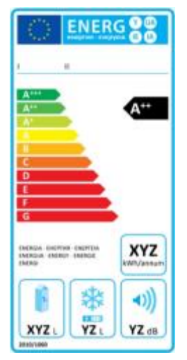
Absorption-type or other-type refrigerating appliances

Since 1 July 2014 only models with energy class equal or above A+ can be placed on the market