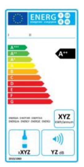
Wine storage appliances